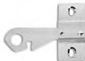
Left Hand Latch