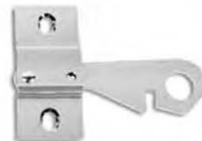
Right Hand Latch